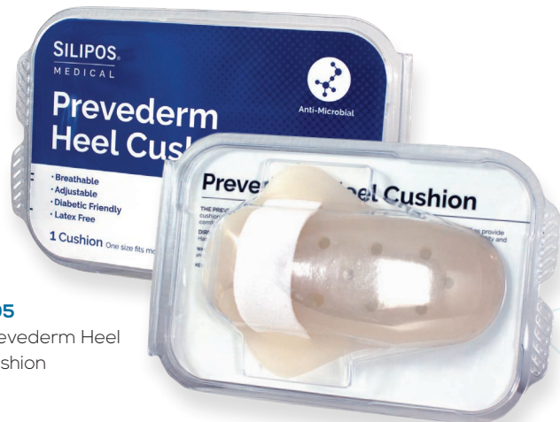
605 Prevederm Heel Cushion